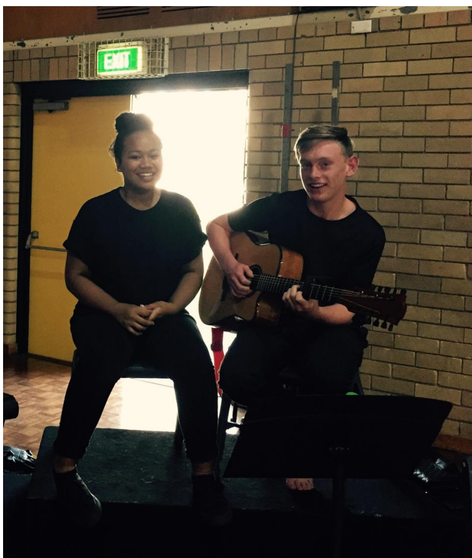
CAPA students performing at the Parent Information Night

Our CAPA staff looks forward to 'Enriching student's self- esteem and confidence in building performance skills and developing their creative talents'