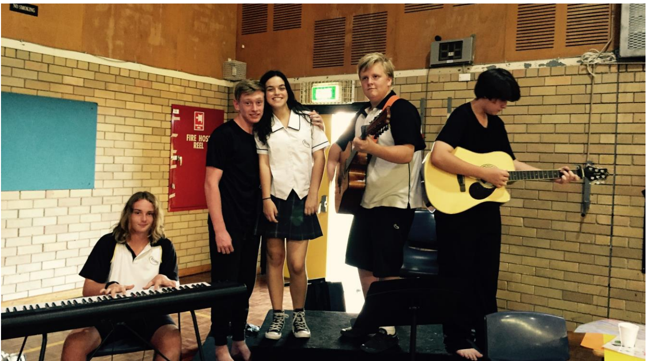
CAPA students performing at the Parent Information Night