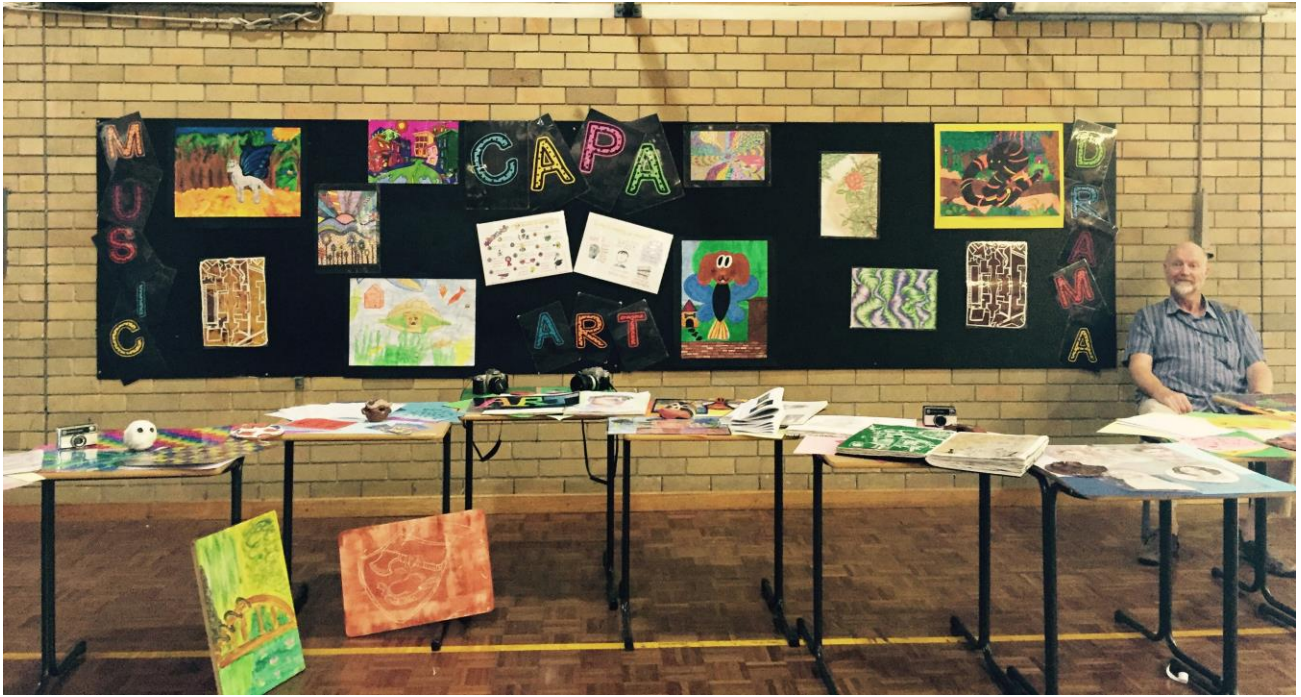
CAPA Presentation for Parent Information Night