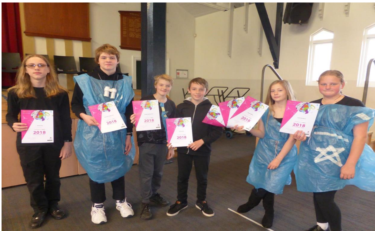
The team receiving their certificates