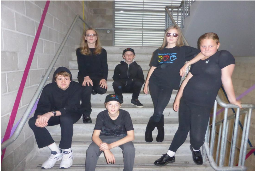
Waiting to do the Spontaneous Challenge