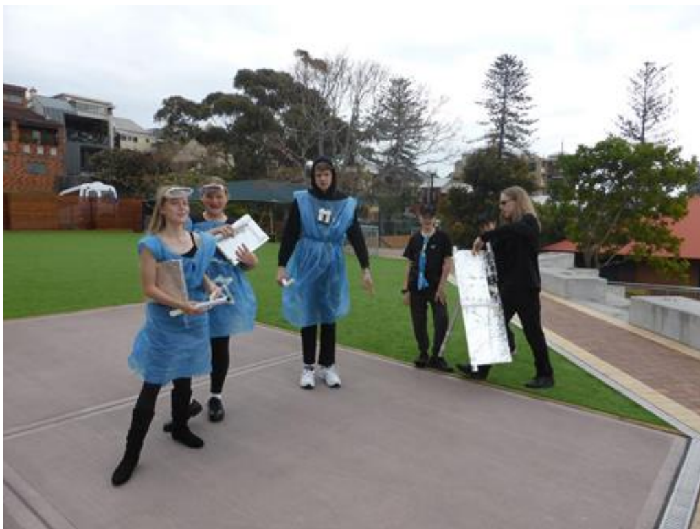
The team rehearsing their performance for the Long Term Solution