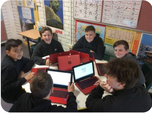
7S students collaborating on a task where they had to identify specific information from Japanese texts.