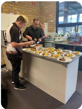
S1 showcased their impressive culinary skills by cooking a mouth-watering baked dinner.

Over the past months FGHS support faculty have been working really hard and having lots of fun (as usual).